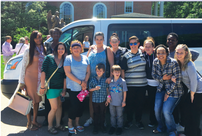
Smiling clients as the keys were handed over to our new van from St. Raphael!